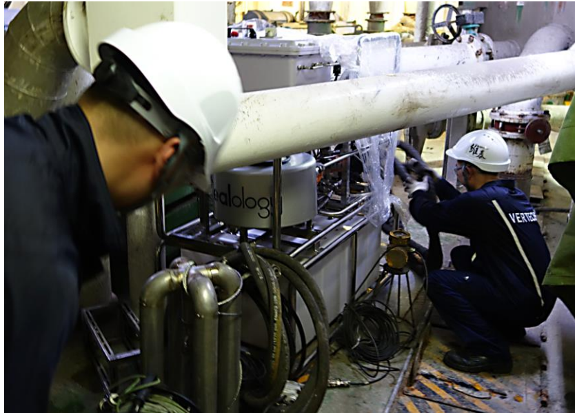
Fig1. Vertechs REALology is deployed in a confined & limited space on the drilling platform.